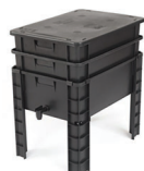
Vermicomposter indoor use

Call Solid Waste Management at 732-745-4170 for more information.