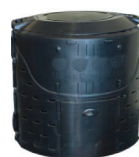
Home Composter 30" high x 32" base 17 cu. ft/125 gal