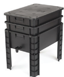
Vermicomposter indoor use

Call Solid Waste Management at 732-745-4170 for more information.