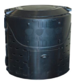
Home Composter 30" high x 32" base 17 cu. ft/125 gal