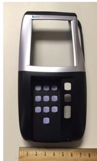
Grocery Store Skimmer