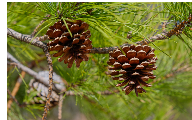
Pitch Pine needles and cones

In spring, listen for the trill of the pine warbler, or the song of the carpenter frog.