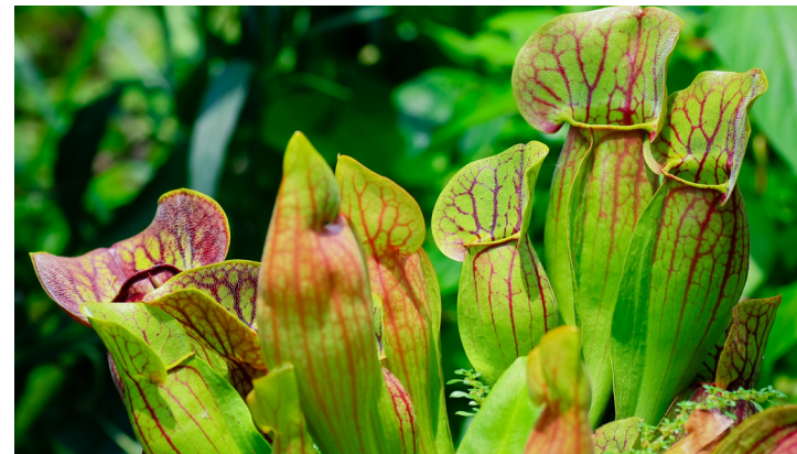
Pitcher Plant (Sarracenia purpurea)

Pickerel weed, white water lily and arrowhead are common.